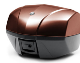
39L Top Case Touring