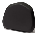
39L Top Case City Passenger Backrest