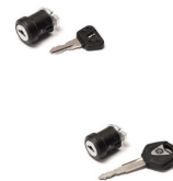
39L/50L Top Case City Lock Set

For all FZ1 Fazer / ABS accessories go to the website, or check your local dealer