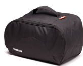
39L Top Case City Inner Bag