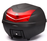
39L Top Case City