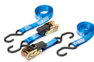
Yamaha Ratcheting Tie-downs