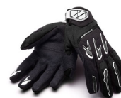
2013 MX Men's Drako Gloves

For all YZ85/LW accessories go to the website, or check your local dealer