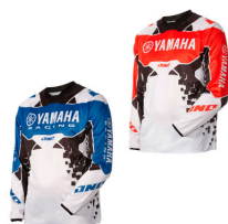
2013 MX Men's Carbon Racing Jersey