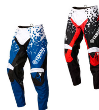
2013 MX Men's Carbon Racing Trousers