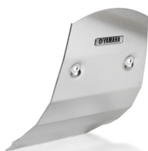
Cross Glide Plate