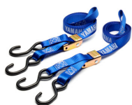
Yamaha Cam Buckles Tie-downs